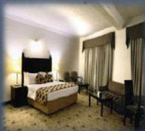
Hill View Hotel, Islamabad