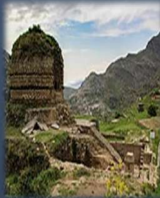
Amluk-Dara Stupa Swat