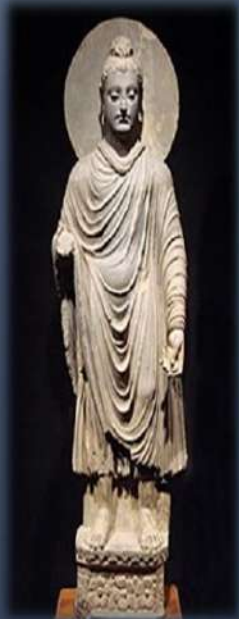
Standing Buddha Gilgit Baltistan