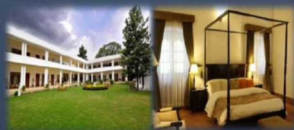
Serena Hotel, Swat