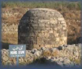
ROUND STUPA - TAXILA