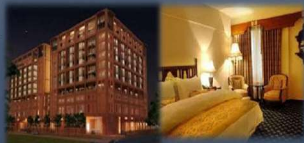
Serena Hotel, Islamabad