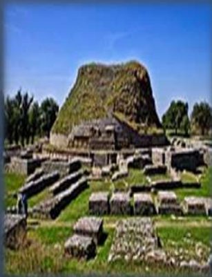
Dharamrajika Stupa Taxila