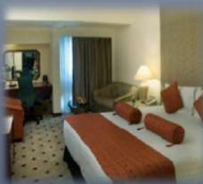
Avari hotel, Lahore