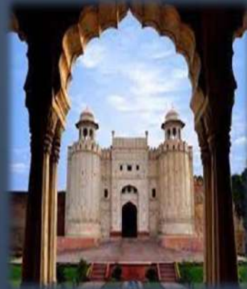
Lahore Fort Lahore