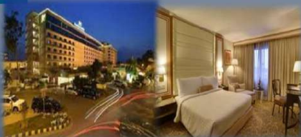
Pearl Continental Hotel, Lahore