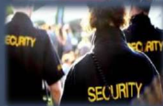
Luxury Transport with Security