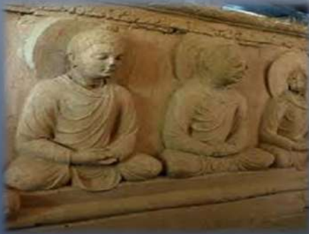
Buddhist Relics Taxila