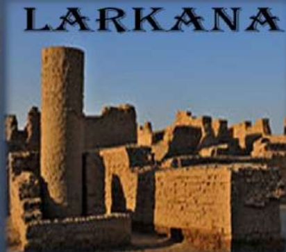
Tall water wells