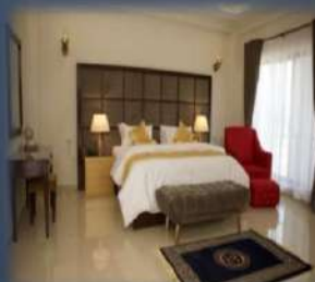
Swat Palace, Swat