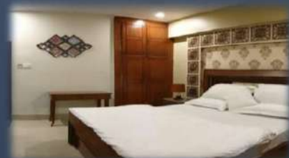
Gold Star, Larkana